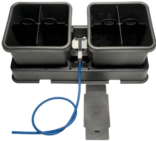
Fits 8.5 L / 2.2 gal & 15 L / 3.9 gal pots as used in 1Pot & easy2grow modules (easy2grow pictured above)