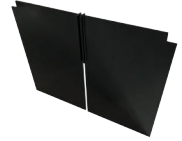
1x Top Divider