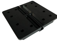
1x PotDivider Base