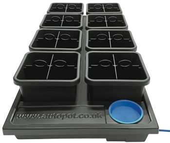
Fits 8.5 L / 2.2 gal & 15 L / 3.9 gal pots as used in Auto8 modules (pictured above)